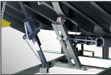
Cam Control Counter Balance Assembly permits smooth ramp extension and easy walk-down of the leveler.