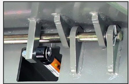
"Box construction" deck with a heavy duty lug hinge design.