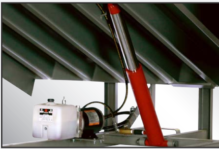
Translucent Hydraulic Reservoir.