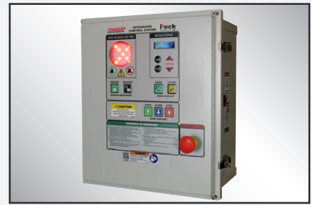
Optional iDock® Controls with online connection to myQ® Dock Management.